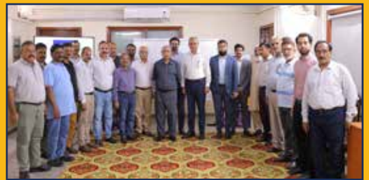
Inauguration Ceremony of a 1MW Solar Power Plant at Shahtaj Textile Limited