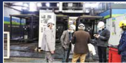
Classified Government Project 3X1400kVA