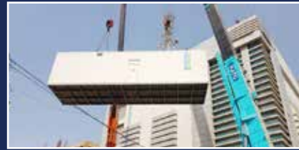
Telenor Karachi 2250kVA