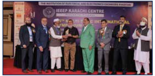
Participation in the 38th Multi-Topic International Symposium- IEEEEP Karachi Center