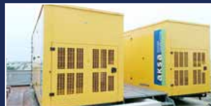
Cybernet Karachi CLS 2X700kVA