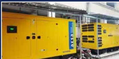
Cybernet Head Office 2X500kVA