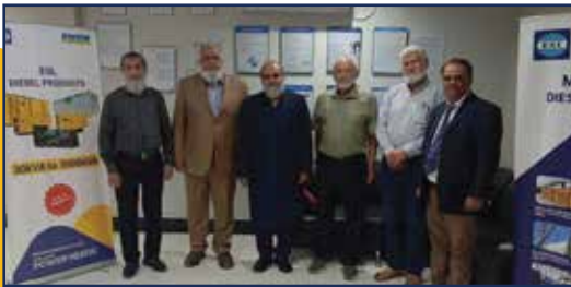
Leaders from ESL and Rastgar seal the partnership with a handshake, marking the beginning of a collaborative journey