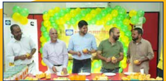
Mango Fest 2024