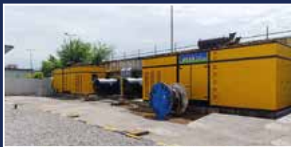
Zong Islamabad 2X2250kVA