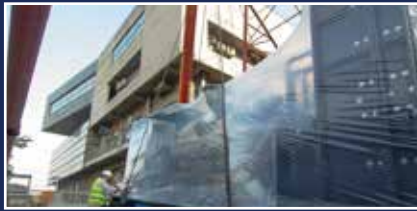
Telenor Lahore 2250kVA