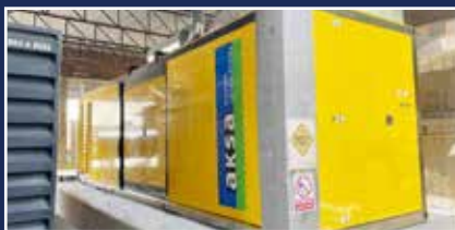
Zong Lahore 1250kVA