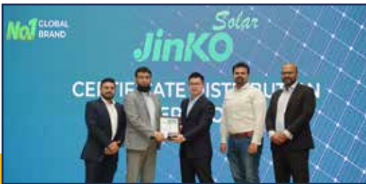
Most Reliable Solar Partners Award in the Pakistan region for 2024 by Jinko Solar