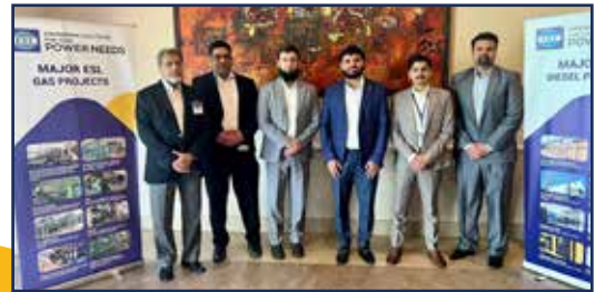
Sponsorship at the Business Opportunity Seminar organized by Constructors Association of Pakistan (CAP) in collaboration with the Association of Consulting Engineers Pakistan (ACEP).