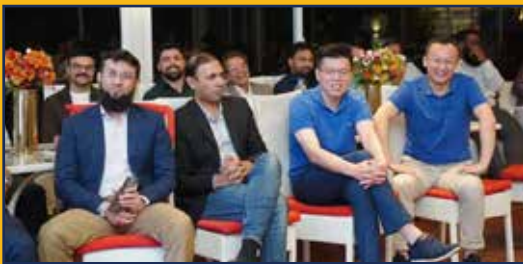
Recognized by Huawei as one of their Top EPC Partners