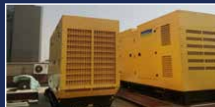
Allied Bank 2x500kVA