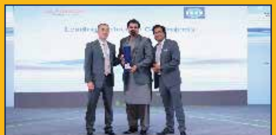
Valued Partner Award from SUNGROW, highlighting our synergy in leveraging SUNGROW inverters for groundbreaking C&I projects.