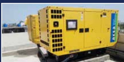
Cybernet Islamabad 2X72kVA