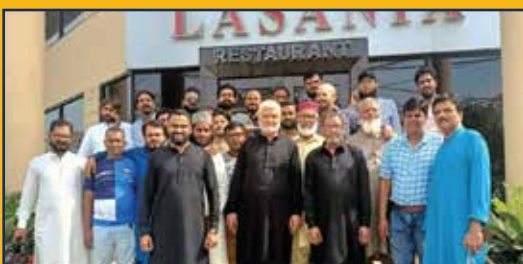
ESL Service Team celebrates outstanding performance with a well-deserved luncheon