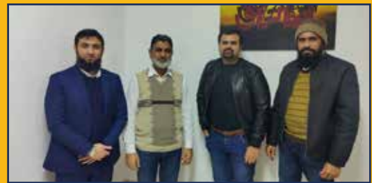
Contract Signing Ceremony - 5 MW Solar Power Plant at Riaz Textile