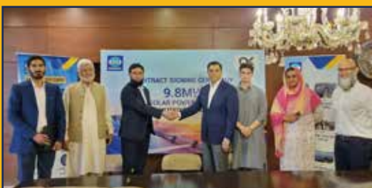
Contract Signing Ceremony - 9.8 MW Solar Power Plant at Alkaram Textile Mills