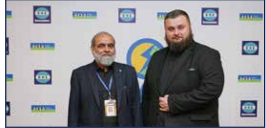
AKSA-ESL Power Seminar