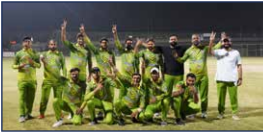
Participation in Engineers' Premier League - Season 3 organized by Muhammadi Event Management in collaboration with Association of Consulting Engineers Pakistan (ACEP)