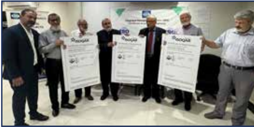
Certificate Awarding Ceremony for IMS Certifications for ISO 9001, 45001 & 14001