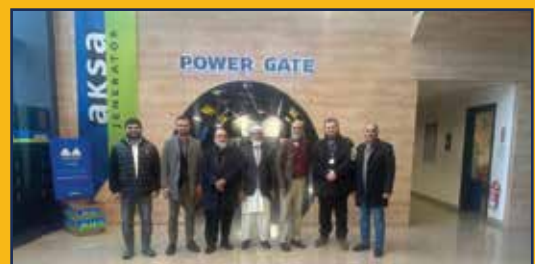
ESL team accompanies top consultants during an insightful visit to AKSA Turkey Headquarters